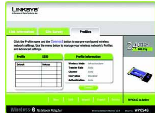
Figure 6-5: Profiles

NOTE: If you want to export more than one profile, you have to export them one at a time.